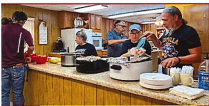
Feed the Cowboys!